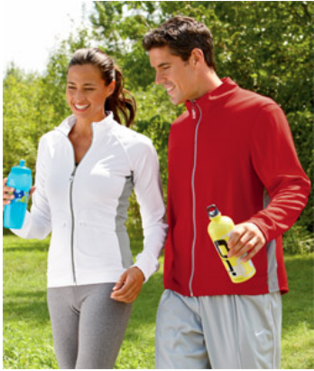
Ladies/Men's Performance Jacket Item #3