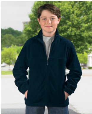
Youth Fleece Jacket Item #1