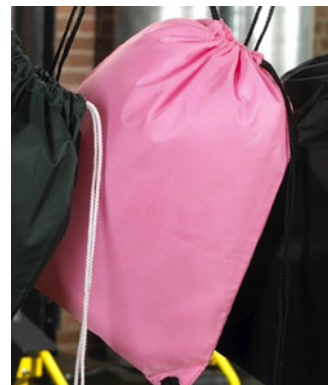
Nylon Backpack Item #11