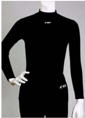
Women's Performance Mock Turtleneck Item #5