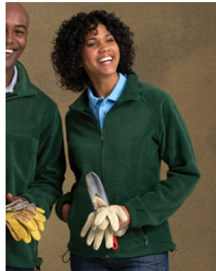
Ladies Fleece Jacket Item #1