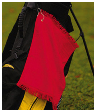
Towel with Grommet Item #12