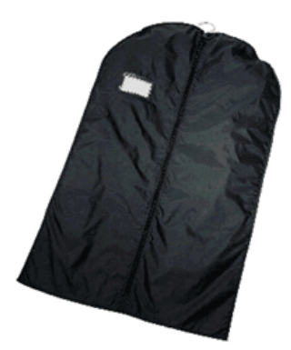
Garment Bag Item #10