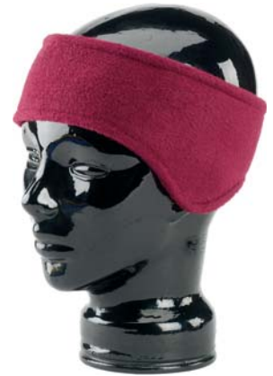
Fleece Headband Item #9