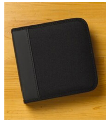
CD Case Item #14