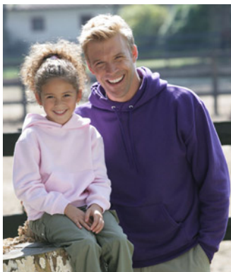
Adult & Youth Hooded Sweatshirt Item #7