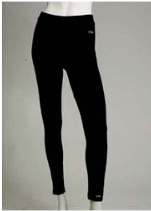
Women's Leggings Item #4