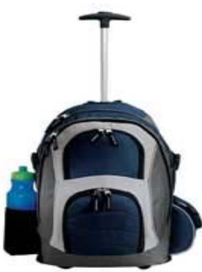
Rolling Backpack Item #13