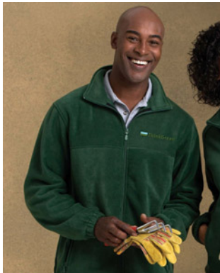
Men's Fleece Jacket Item #1